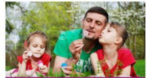
Early Help Booklet

Early Help in Worcestershire have created a booklet to help families find out about the help and support available in the county for children and young people aged 0-18 years old. The new booklet will help you and families find the most appropriate support.