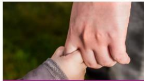
Early Help Family Support